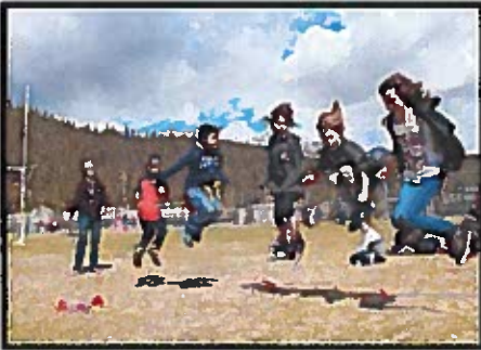
Jump Rope for Heart Skipping Assembly