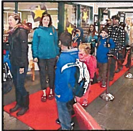
First Day The STARS of JES