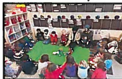
Roots of Empathy Program