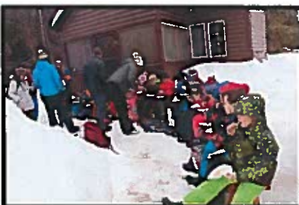
Maternelle Visit to the Maligne Canyon Hostel