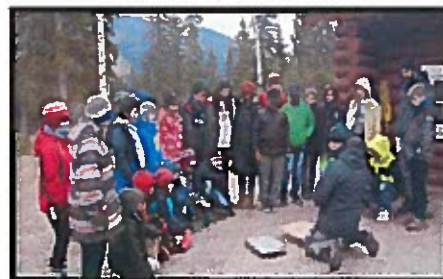
Grade 5/6 Visit to the Palisades