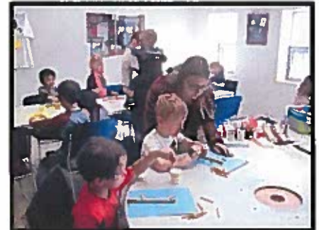
Maternelle Students Making Crafts