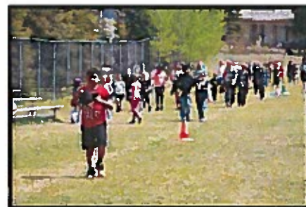
School Fun Run Energy Cube Challenge