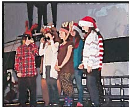
6e année Performing at Christmas Concert