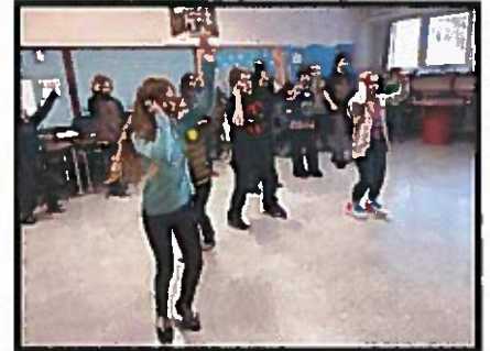
Flashmob Video Contest