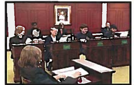
Grade 6 visit to the Legislature