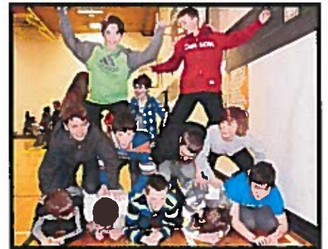
French Immersion Dance