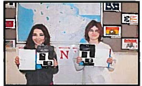
Our read-a-thon winners!