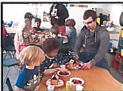
Kindergarten Class Being Creative