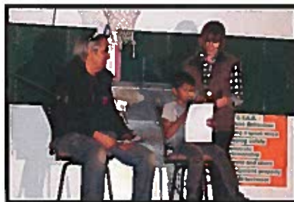
Mr. White Retirement Spotlight Assembly