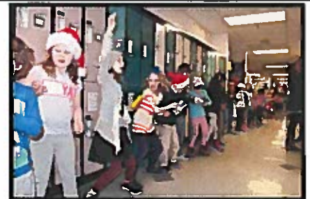
La Chaîne de la Solidarité