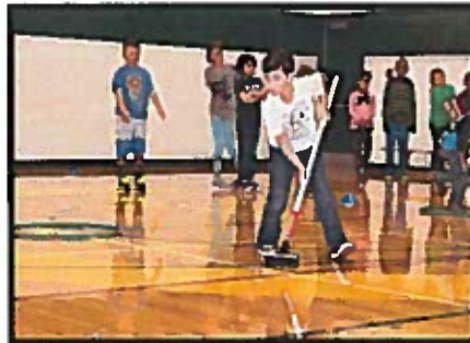
Learning to Curl