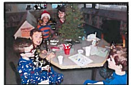
Light up the library event!